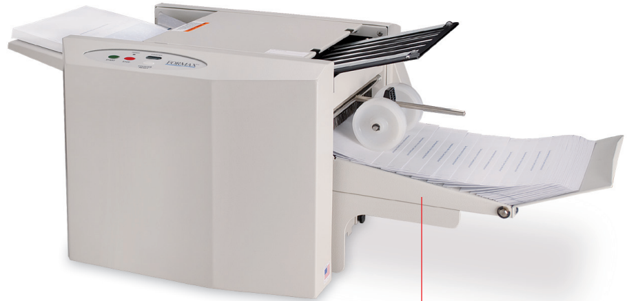
Integrated Output Conveyor