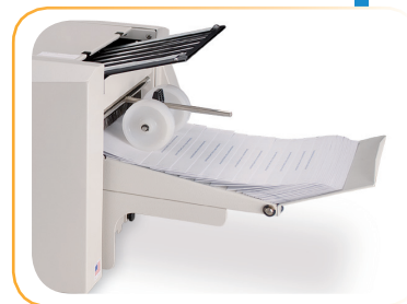
Integrated Output Conveyor

The FD 1500 Plus is built with proven Formax technology. Heavy-duty steel construction offers the dependability and power expected of a larger unit in a smaller package. A processing speed of up to 5,200 forms per hour enables an operator to complete daily jobs in no time. Plus, the integrated output conveyor keeps processed forms in a neat, sequential order.