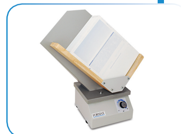
402 Series Jogger - an option which reduces static electricity from forms and aligns them for proper feeding