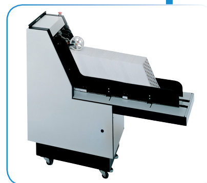
FD 2000-60 Bulk Input Loader (optional for FD 2094)