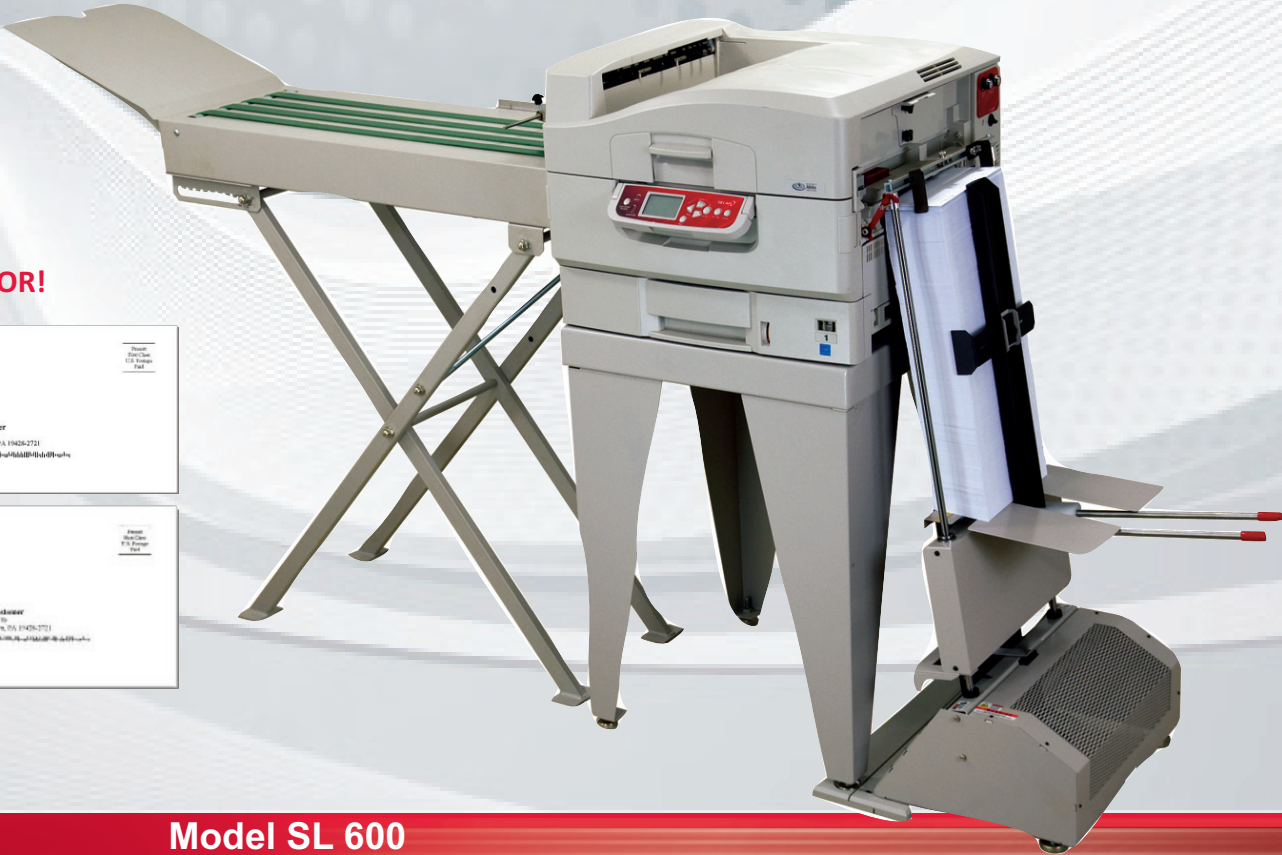
Model SL 600