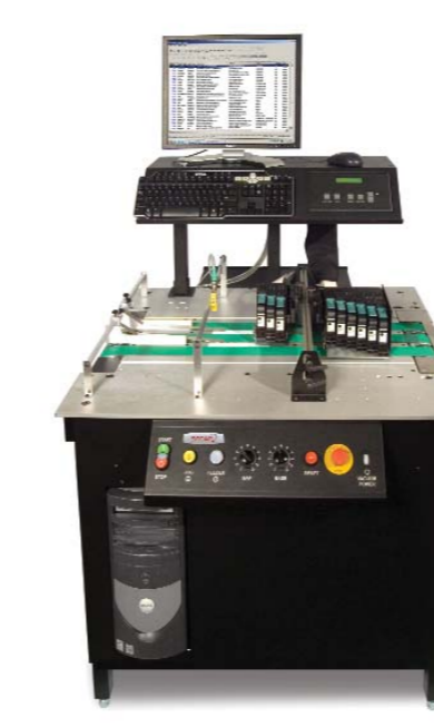
QuikJet 36 configured with 4.5" of print.