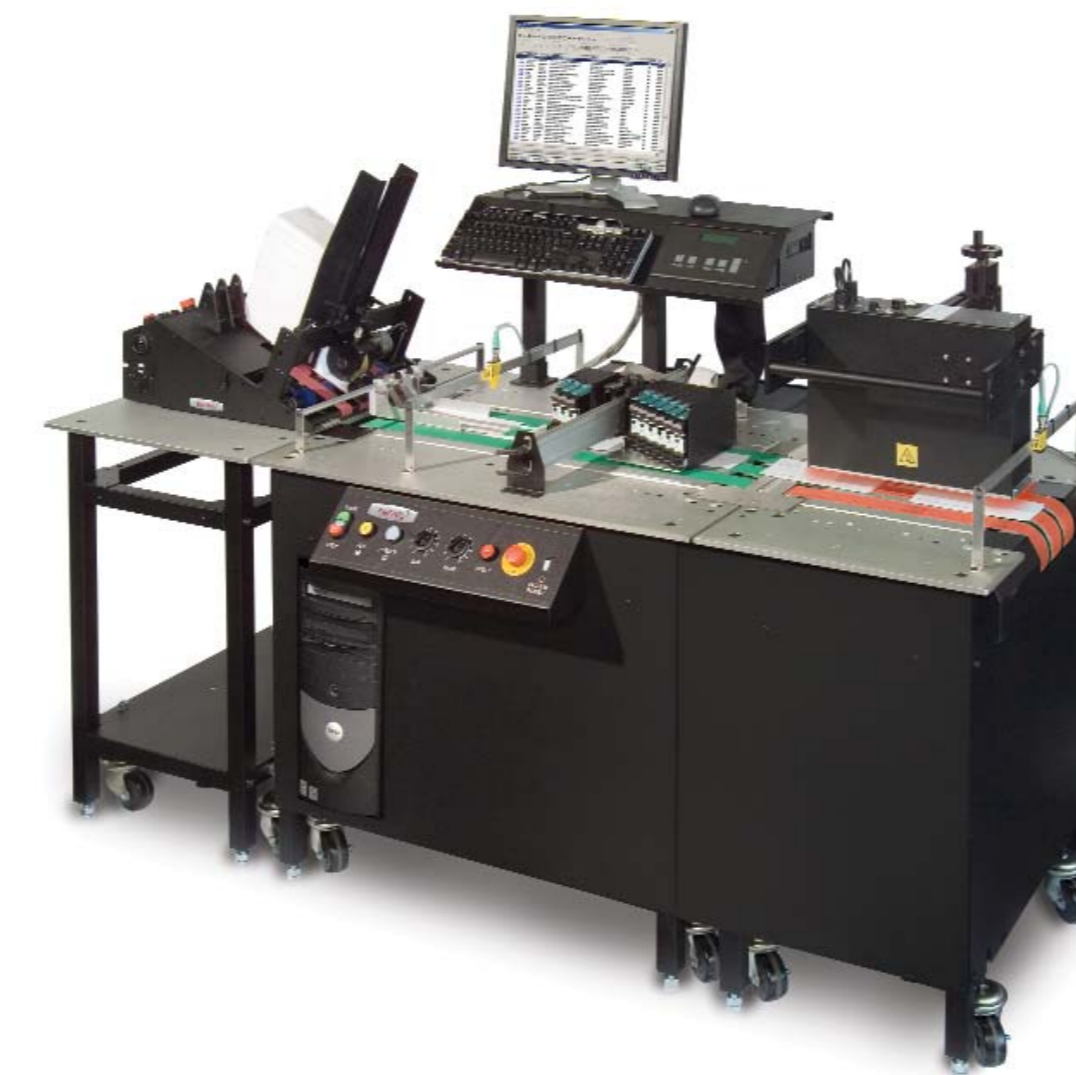
The QuikJet 36" shown with 1500IJ friction feeder on 20" stand, 4.5" print and 2000 Watt dryer on 20" base.