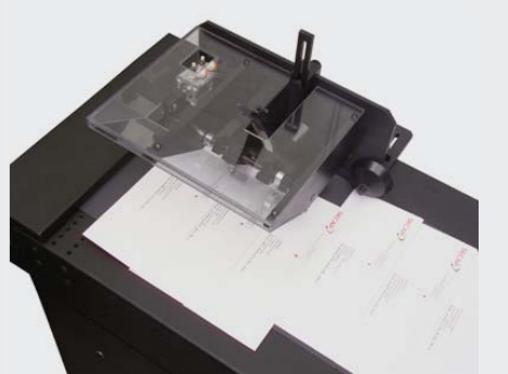
Close up of the UltraSort™ conveyor. Automatically creates tray breaks for improved separation and material handling.

QuikJet conveyors improve material handling and air drying of addressed material. Choose either the standard conveyor or UltraFeed conveyor. Both conveyors feature a wide belt design to handle glossy and coated stock at high speeds for superior material handling. Available in either 6' or 9' lengths.