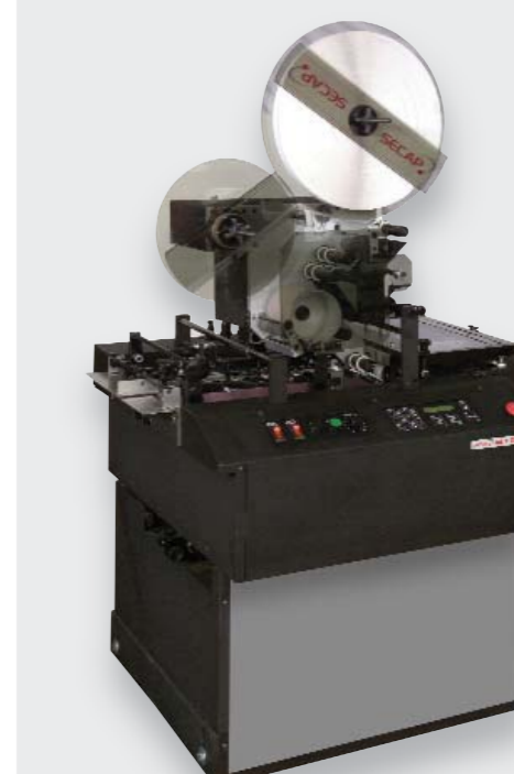
High capacity production tabber.

Add a heavy duty production Tabber-Labeler-Affixer to complete your mail-stream process with an in-line or off-line production tabber. Accurate, consistent placement of single, double or triple tabs on the left or right side of your mail piece. Configuration solutions available for toe and heel tab requirements.