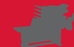
FOLDERS AND INSERTERS