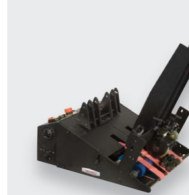
1500IJ friction feeder available with or without stand.