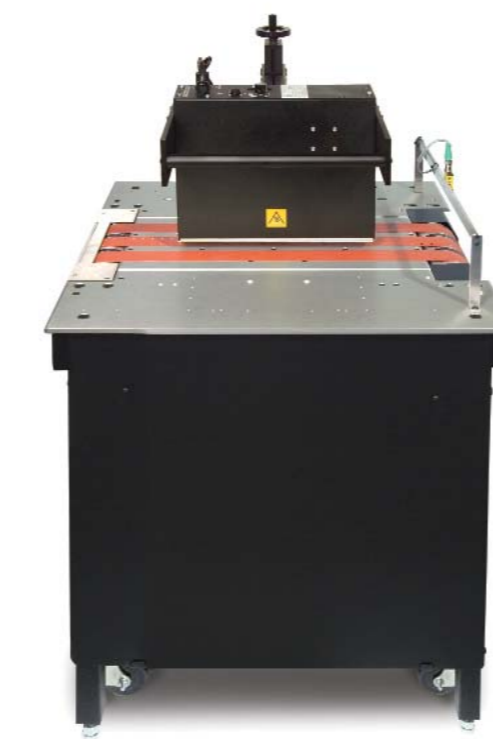
Dryer base available in 20", 30", or 36" length dependent upon your requirements.