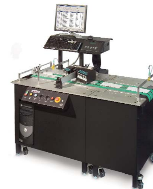
QuikJet 56 configured with 4.5" of print and 56" in length.