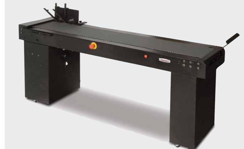
Standard high production conveyor/stacker.