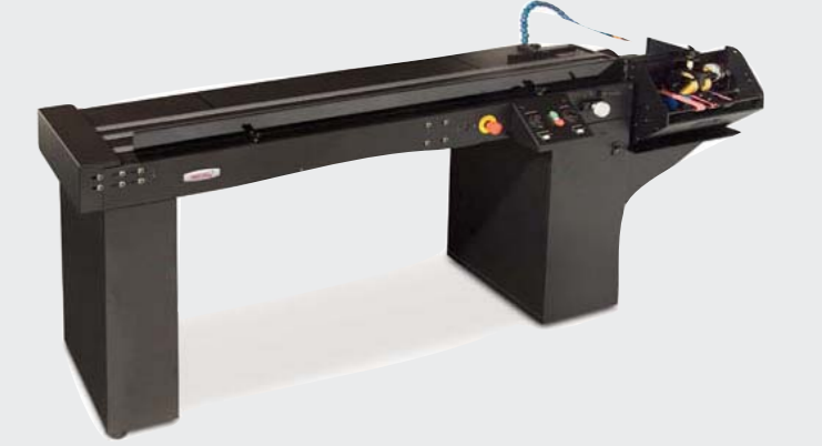
UltraFeed™ high capacity feeder available in 6' and 9' lengths.

The UltraFeed high capacity feeder delivers maximum capacity handling up to 4,500 #10 envelopes (9' UltraFeed) at a time. Having an inline feeder reduces operator intervention and increases productivity. The feeders synchronize with the vacuum transport base for increased efficiency.