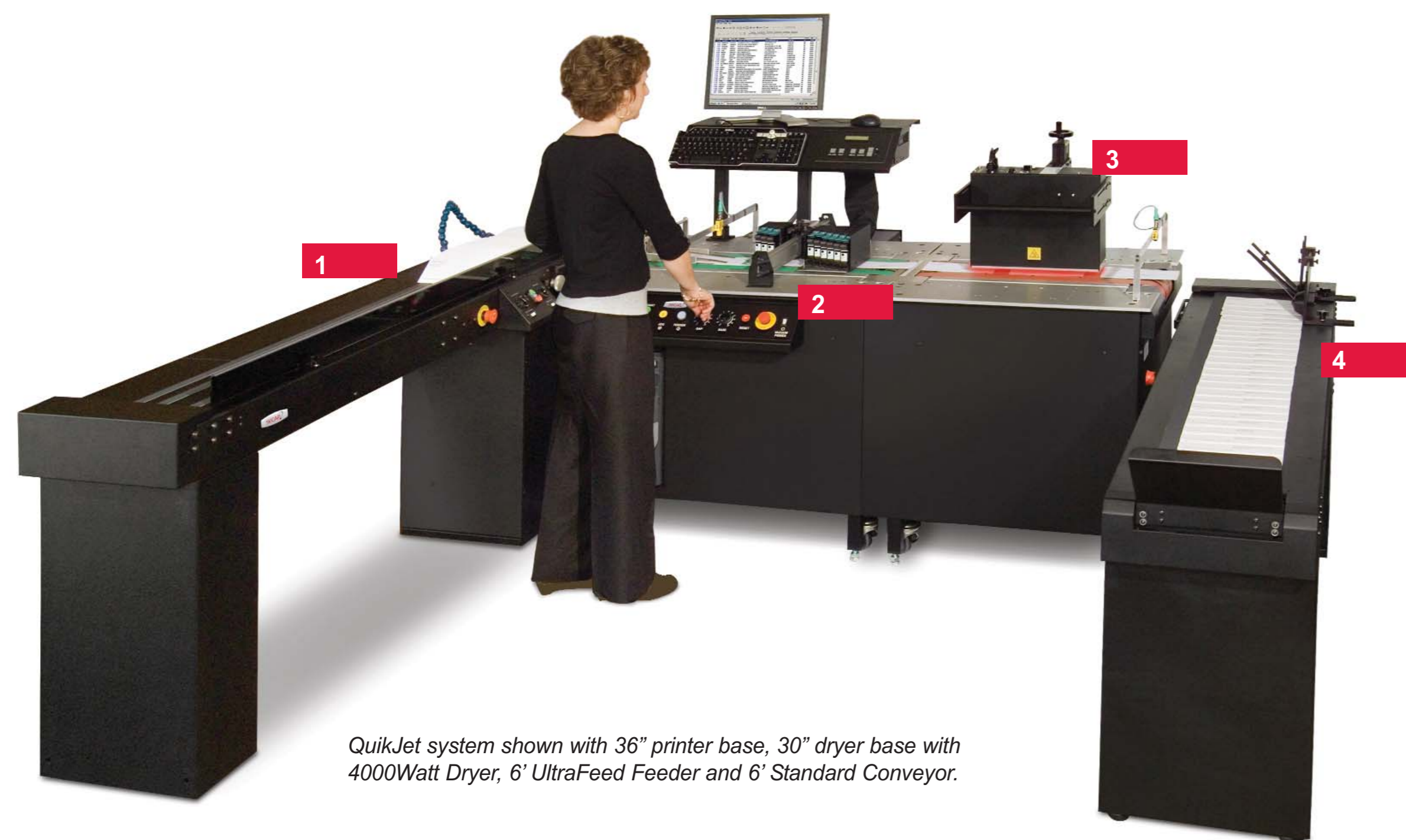
QuikJet system shown with 36" printer base, 30" dryer base with 4000Watt Dryer, 6' UltraFeed Feeder and 6' Standard Conveyor.

Choose a standard conveyor (shown) or UltraSort™ conveyor, 6' or 9' lengths. The conveyor provides additional drying time and assures neat, accurate stacking of finished pieces.