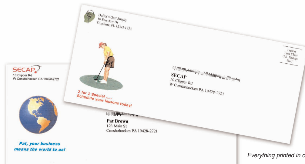
Everything printed in one pass.

Personalizing and using color on your outgoing mail just got faster and easier. With the SA3350, you can do both, making a good thing even better. Print in brilliant full color for eye-catching appeal that gets attention and makes your piece stand out in a heap of mail! Use color in your logo and graphics. Personalize using your customer's name for greater impact and effectiveness. Best of all, do all this in one pass for maximum productivity!